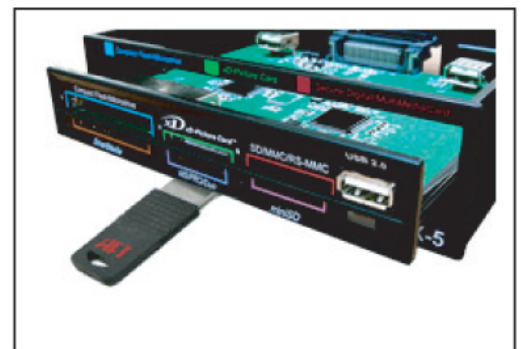
Service Key to eject Reader Cartridge