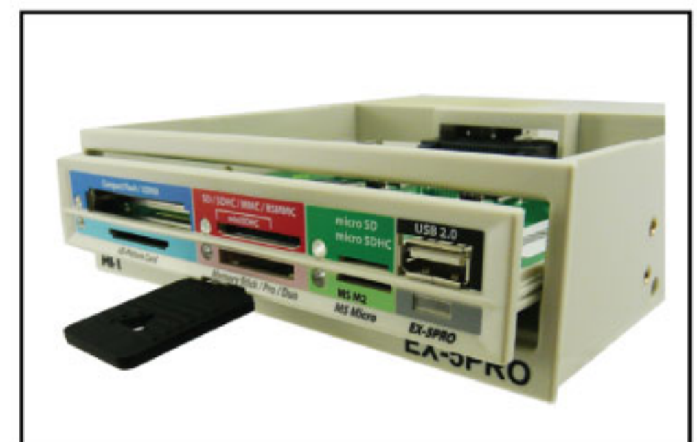
Service Key to eject Reader Cartridge