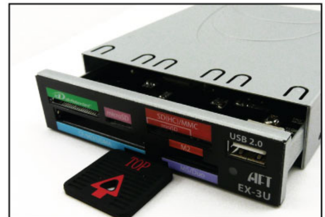
Service Key to eject Reader Cartridge